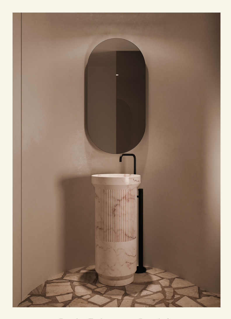
Doric Estremoz Pardais